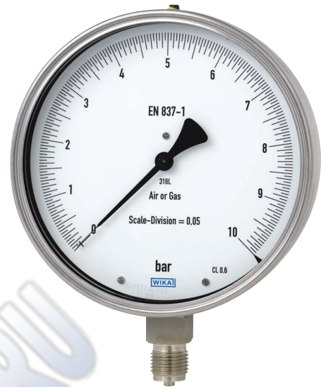
Test gauge series, stainless steel, model 332.50